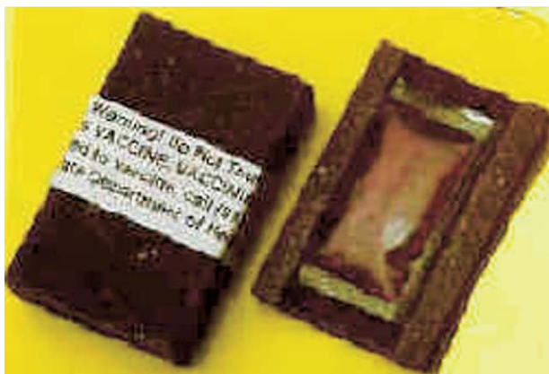
Figure 2. Picture of a rabies vaccine–laden bait used to orally vaccinate raccoons and other terrestrial reservoirs for rabies (picture courtesy of the Centers for Disease Control and Prevention).

ferrets should be vaccinated against rabies and re-vaccinated according to the Compendium of Animal Rabies Prevention and Control 2005 produced by the National Association of State Public Health Veterinarians, Inc ( http://www.nasphv.org ). Cats and ferrets should be kept indoors, and dogs should be supervised when outside to minimize the potential for exposure.